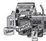
oils, solvents, pesticides