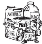
household hazardous waste